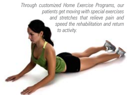
Through customized Home Exercise Programs, our patients get moving with special exercises and stretches that relieve pain and speed the rehabilitation and return to activity.

All these resources — orthopedic specialists, a comprehensive spine center, diagnostics, therapy and an Ambulatory Surgery Center — are all housed under one roof in the Bone & Joint Center Building so you don't have to drive around town anymore. Now isn't that a welcome change.