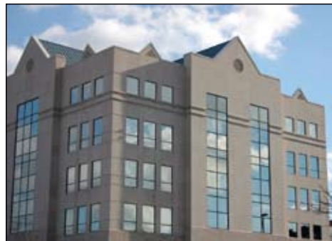
Capital Region Orthopaedics, as one of the largest orthopaedic groups in Upstate New York, puts everything under one roof in The Bone & Joint Center near Interstate 90. The Center combines specialists in orthopaedics and spine, diagnostics, physical therapy, and an Ambulatory Surgery Center for the convenience of the patient.